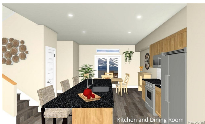
Kitchen and Dining Room REcolorado