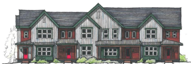
STREET ELEVATION REcolorado

Enjoy an open concept living area with large kitchen island and a huge deck for outdoor living space. Dine outside with sunset views over Colorado's highest peaks or soak in your hot tub under the stars! This living space includes an unfinished lower level with option to add a large 4th bedroom/bonus room and an oversized 2 car basement garage. The upstairs features a master suite complete with its own covered deck and master bathroom with dual vanities. Railyard Leadville adjoins the Mineral Belt Trail, and is minutes away from skiing, hiking, bicycling, fishing and endless outdoor recreation opportunities. Come see what luxury mountain living looks like. Additional builder plans are available, but supply is limited and prices are subject to change. Schedule your appointment today to learn more about this exciting new community!